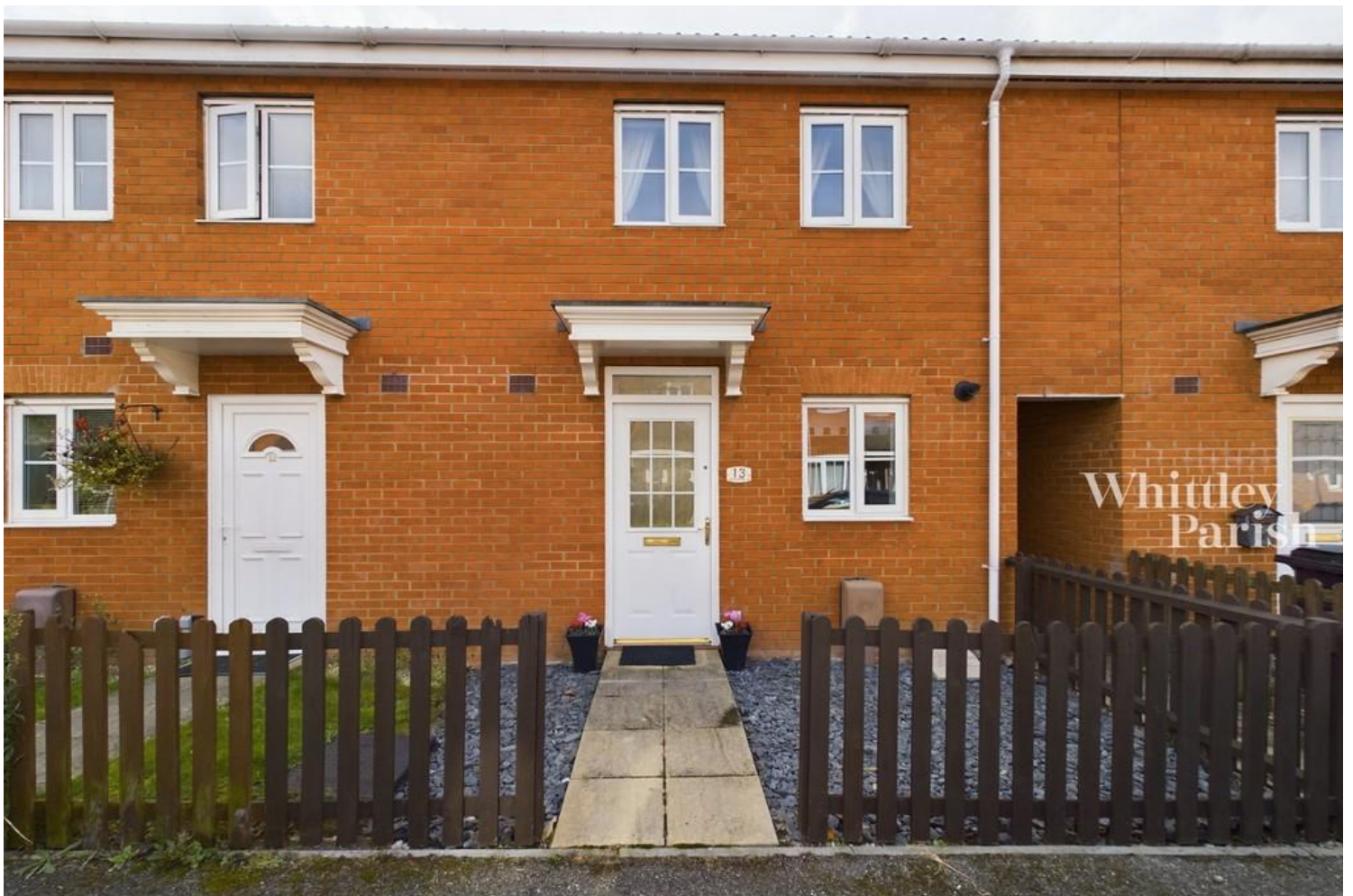
Viscount Close, Diss, IP22 4GL Guide Price £198,000